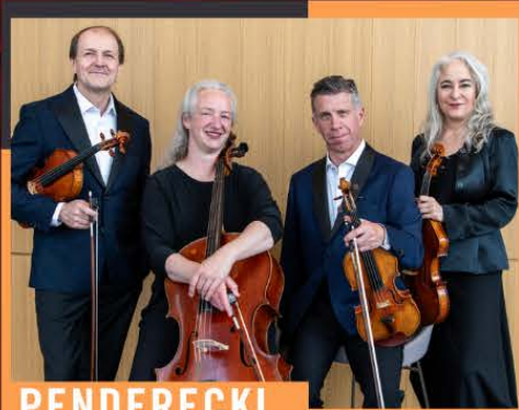
PENDERECKI STRING QUARTET