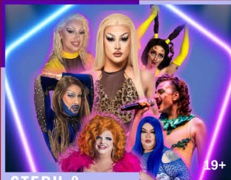
STEPH & FRIENDS DRAG SHOW