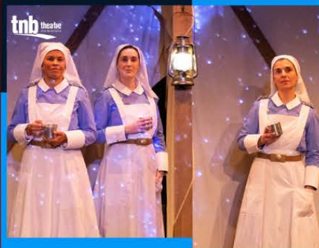
BLUEBIRDS By Vern Thiessen