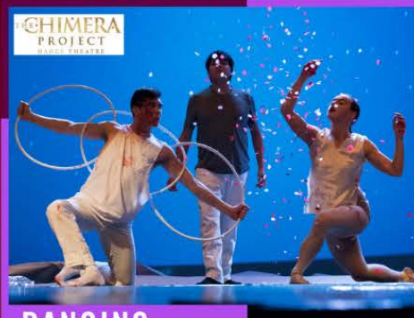
DANCING THE SEVEN TEACHINGS